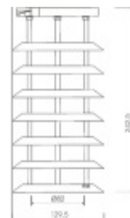
Big stainless steel louvre reflector mounted upwards