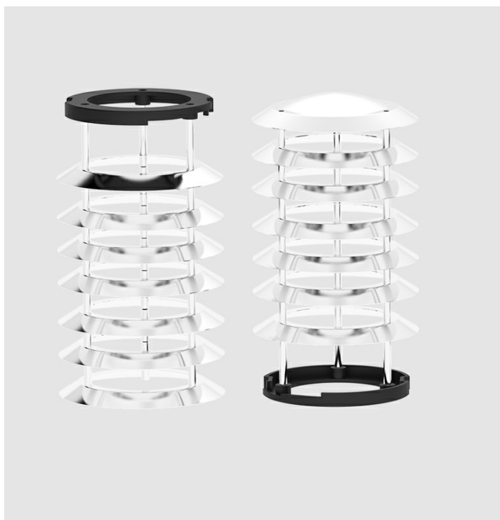
Big stainless steel louvre reflector mounted downwards